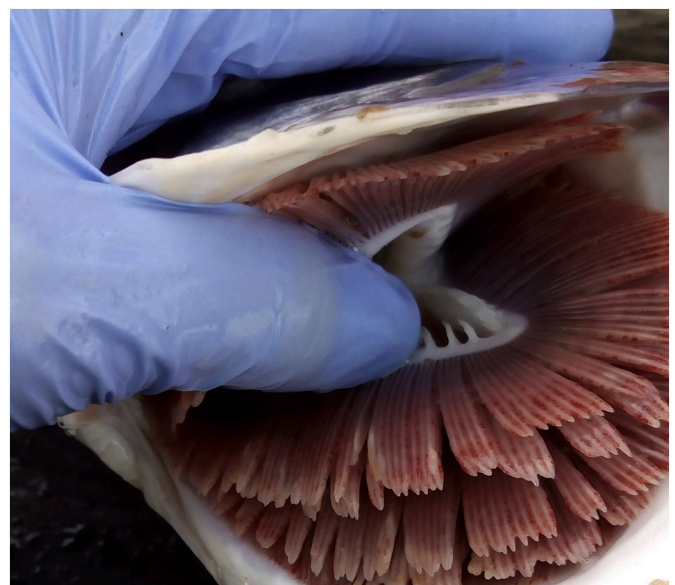
Fig. 1. Photo of the gills of a farmed Atlantic salmon ( Salmo salar ) with confirmed anemia. The gill filaments are pale and exhibit pinhead hemorrhages/ microhemorrhages.

Anemia in salmonid farming has been associated with some of the